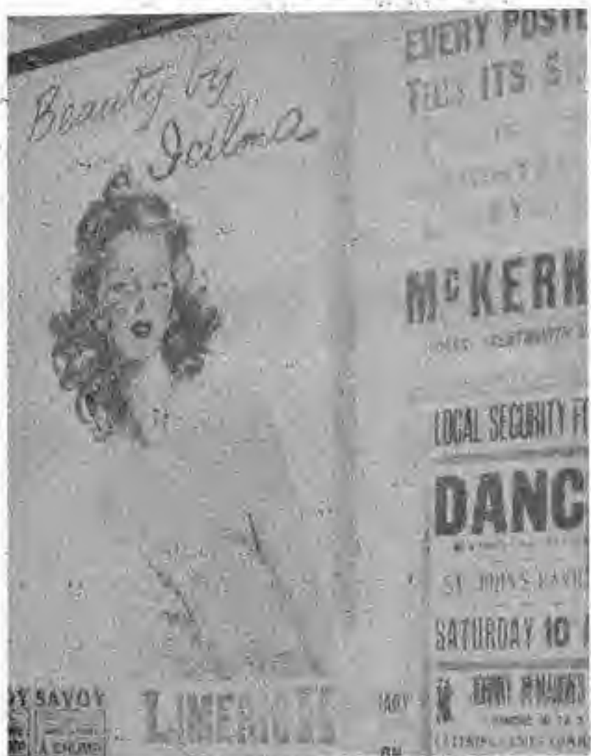
PURITY BY BROWN PAPER